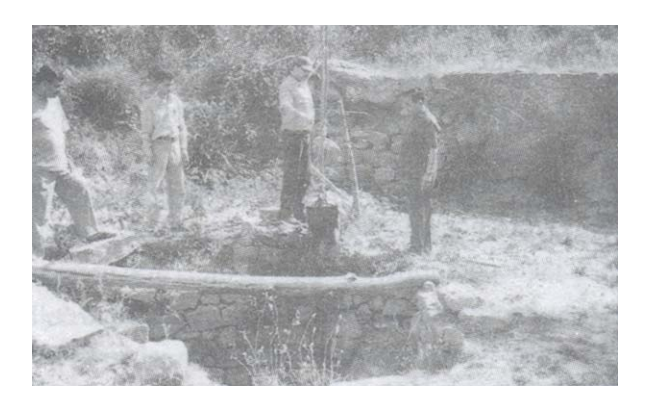
Fig.8: Dungali at Koke-Baggi with load & bucket arrangement to lift the water (The depth of water is 1.8 meters from the surface)

Khu: At many places in the Changar the water table is relatively shallow. It is at these places the subsurface water is utilised for irrigational purposes by digging out wells at specific locations. Water is generally lifted from these wells by load and bucket method. Khu are generally stone lined, while the undeveloped wells are called dungali (Fig.8). These are traditional dugwells of Changar . The traditional genius utilised for locating the depth of the water table could not be traced. In some incidents the water was reportedly struck accidentally and these sites were later developed into khu or dungali .