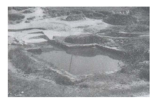
Fig.7: Pukki chappri on a sappar near Thill