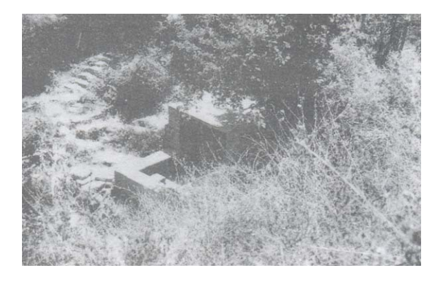
Fig.2: A bawari

Bawari : Bawari (Fig. 2) is the main source of drinking water in Changar. This is a generally a square structure with flights of stairs on all the sides (Fig. 3) There is a natural seepage of water within the structure. The source is generally roofed and a wall is erected around it to ward off the animals and also to prevent used water from polluting the water source. This structure is observed almost everywhere in the hills, e.g., naula of Kumaun. Smaller and larger variations of bawari are called bouru and naurh. Provision is made for washing of clothes in the vicinity. Peepal tree regarded as purifying and some sort of worship stones are often observed to be associated with Bawari and this is the Changarian example of nature-man-spirit complex. Those worshipped are nag devata and the ancestors.