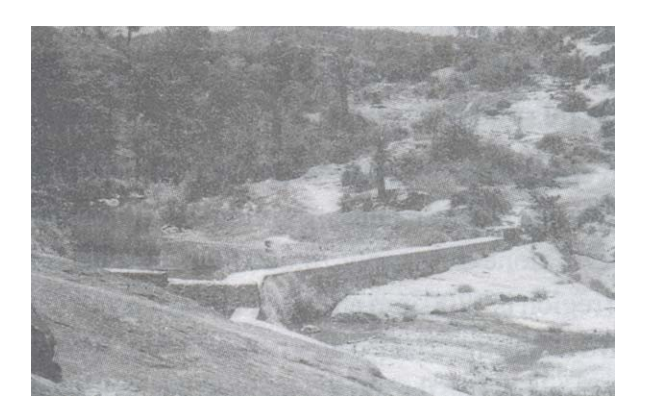
Fig.9: Bundh to harvest rainwater near Balera