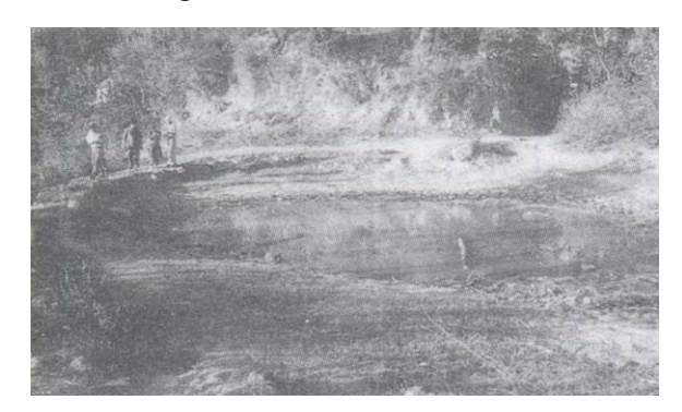
Fig.6: Chappri near Mor village in Khundia

Chappri: These are small depressions in the hill side (Fig.6) generally at the slope break. Water collects in these during the rains and is used for feeding the animals and irrigation later on. Besides providing water, chappri enhances recharge of goundwater, retards quick runoff and thus erosion. Disruption of chappri has led to the depletion in the yields of the downstream bawaris . These structures are also observed in Garhwal Himalaya, where these are termed as chaal . These are generally clay lined; pukki chappri is also observed in sappar (Fig.7). While enhancing the storage capacity of the chappri care should be taken to ensure that the clays at the base of these do not get disturbed which may lead to leakage of water.