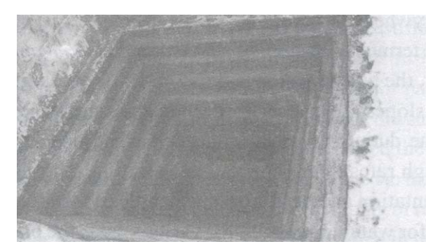
Fig.3: Traditional stepped architecture of a bawari