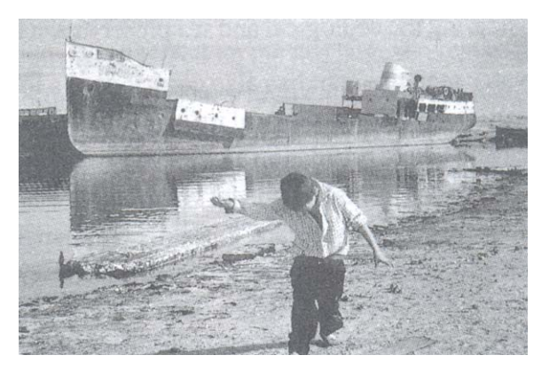
The Grounded Ship at Aral

Due to the impact of desertification, degradation of ecosystem, worsening water-salt balance and changing regional and global climate, the Aral region has entered into qualitatively a new phase that has already been started. The environment of the region has sharply worsened due to polluted atmosphere, drinking water and soil.