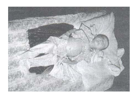
Children Hospital in Nukus

Socially uncontrolled use of natural environment in the Aral Sea basin has now stepped over the critical level of its self-defense, and thus exceeded the rate of self-recovery of the geosphere.