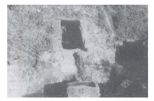
Fig.5: Kbatri in hard sandstone